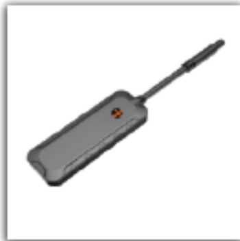
Vehicle Tracker V1.0