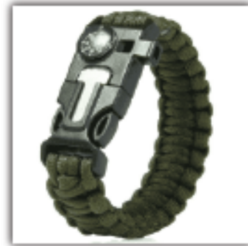
Survival Bracelet V2.0