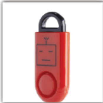
Personal Safety Alarm/ Panic alarm- 110 dB