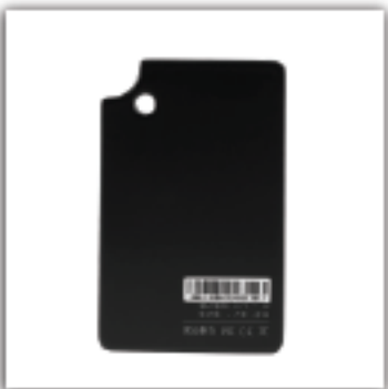
LK01- ID Card GPS