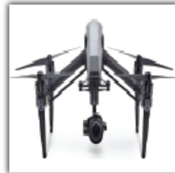
DJI Inspire 2 Drone