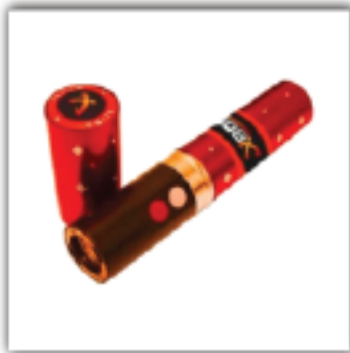
Bling Stun Gun+ Torch