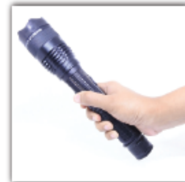
E - Wave V2.0