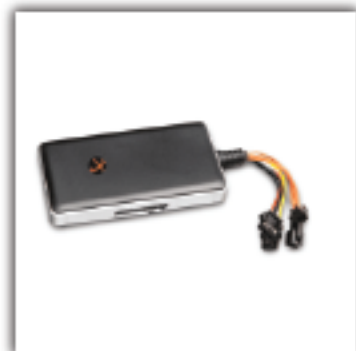
AT04- Asset tracker