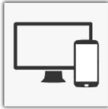
Web And Mobile App