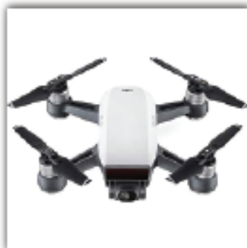
DJI Spark Drone