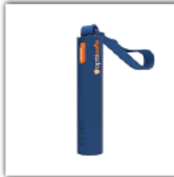
Optisafe SOS Device with Tracking