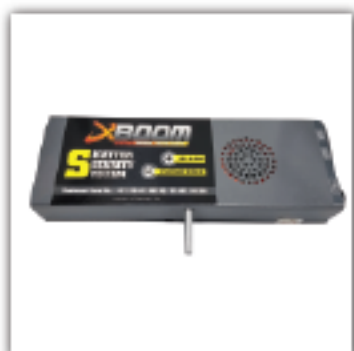
Shutter Security alarm