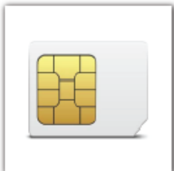
SIM cards support for data and sms