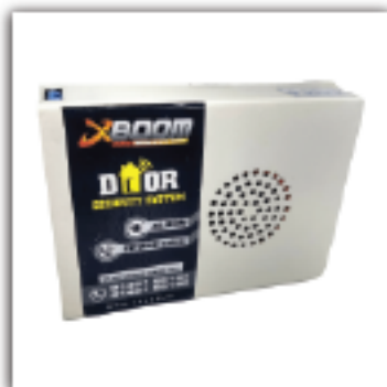
Door Security Alarm