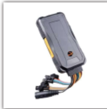
Vehicle Tracker V 4.0