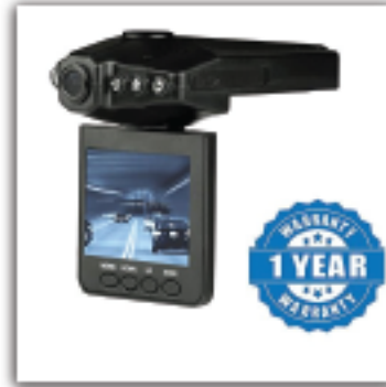
Dash camera V1.0