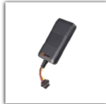
Vehicle Tracker V 2.0