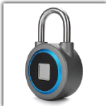
Smart lock with fingerprint security.