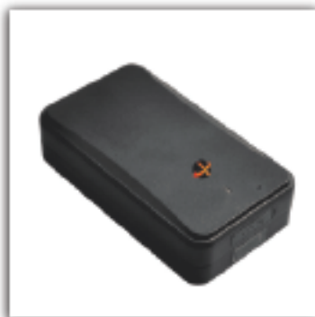
AT04- Asset tracker