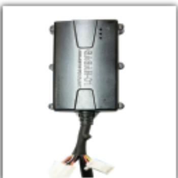
V7.0 AIS 140