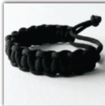
Survival Bracelet V1.0