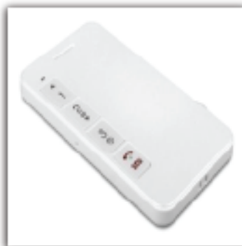
GK309 - iD card GPS Trackers