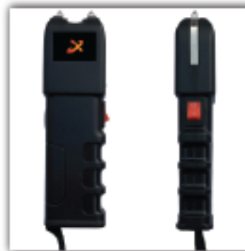
E - Wave