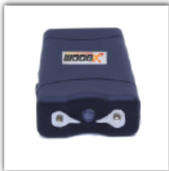
Electron+ - 6.8 Million volts