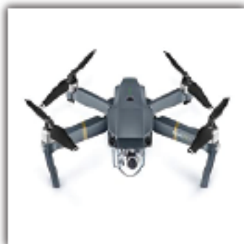
DJI Mavic Pro Drone