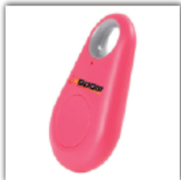
cTag- Bluetooth Tracker