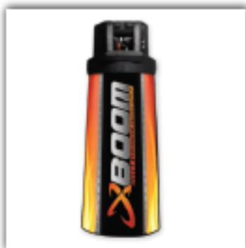
Advanced Pepper Spray