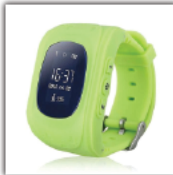
Neo-Child GPS Watch