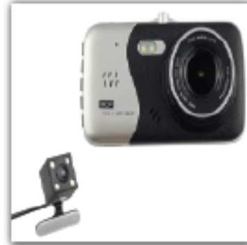
Dash Camera V2.0